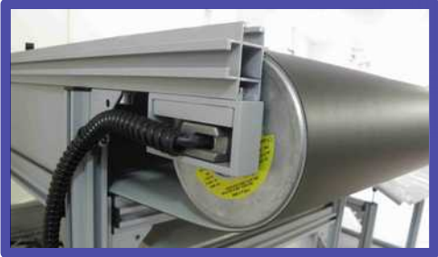
No Vibration Motorized Cylinder