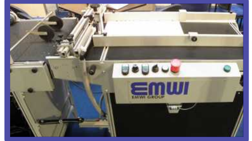
Connected to SFF Suction Feeder