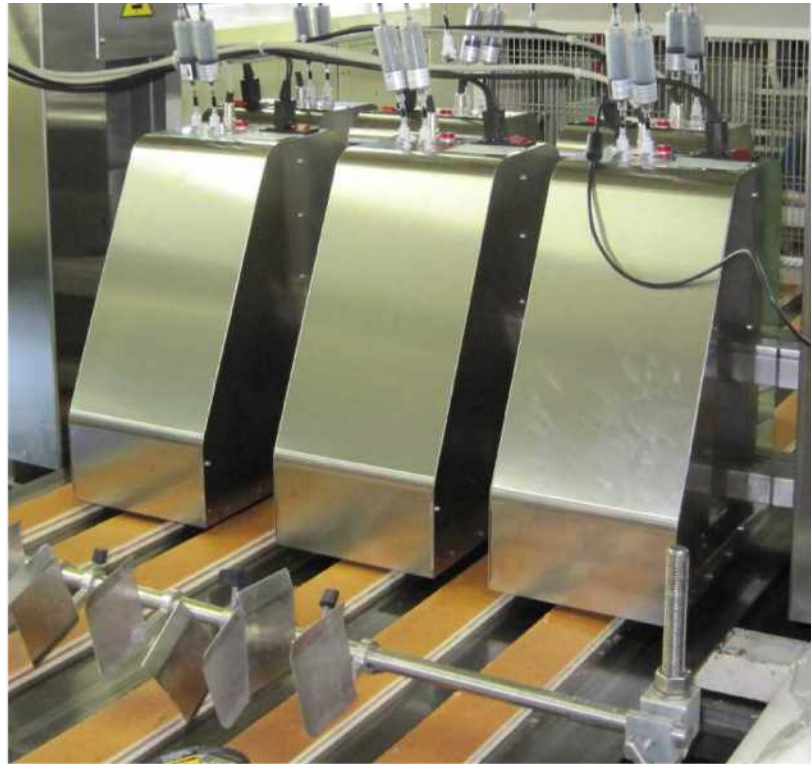
EMWIJET Spres from cardboard to food always single pass